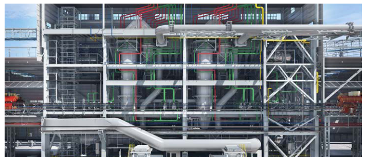
Through digital design and construction management, WISDRI shortened the design cycle by 38 days and construction period by 76 days.

“Utilizing Bentley’s software platform’s standard data parsing and transmission, it constructs intelligent digital twins for iron and steel smart operation and maintenance,” explained Xuezheng. The digital twins provide intelligent, full-lifecycle facilities digitalization, enabling WISDRI to achieve their smart, efficient, green, and low-carbon project goals. The technology solution optimized steel and iron production processes, saving an annual 51,500 tons of standard coal and reducing annual carbon emissions by 346,500 tons. “Through these digital means, this project effectively achieves high-quality, high-standard, environmentally friendly delivery of results and smart maintenance goals, significantly improving the efficiency of personnel at all stages and reducing labor intensity,” concluded Xuezheng.