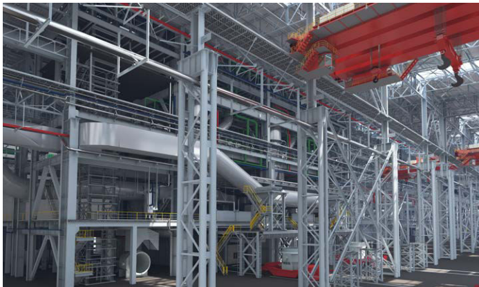
WISDRI leveraged ProjectWise with Bentley’s digital twin technology to deliver smart, eco-friendly, low-carbon facilities.

With OpenPlant and OpenRoads, WISDRI optimized the design process, performing parametric, detailed 3D modeling to adapt to the sloping terrain while minimizing the project’s spatial footprint. Integrating STAAD for seismic calculations ensured structural safety while iTwin Capture Modeler and SYNCHRO facilitated real-time, visual construction monitoring of on-site works.