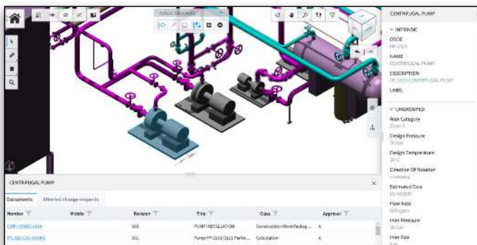
ALIM enables you to view current asset information through 3D models.

Start with asset information and build your digital twin